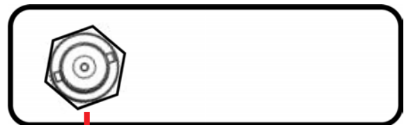
① 1. 3G/HD/SD-SDI Input